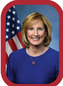
Congresswoman Claudia Tenney