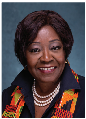
Assembly Majority Leader Crystal D. Peoples-Stokes

425 Michigan Avenue, Suite 107, Buffalo, NY 14203