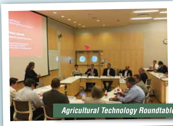
Agricultural Technology Roundtable