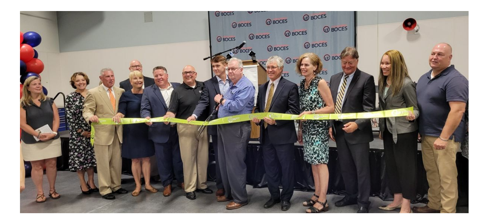
Standing with Union Workers

I attended the grand opening for Capital Region BOCES' Career and Tech Education Center, which is set to offer 25 workforce training programs in eight high-demand career fields. The new state-of-the-art labs and learning spaces and on-site daycare is a much-needed upgrade from the previous antiquated buildings. Training will also be consolidated at the new center that supports the creation of a skilled regional workforce.