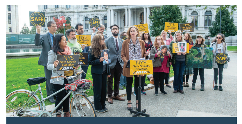
This fall, I gathered with the Families for Safe Streets Coalition and other advocates to urge the Governor to sign life-saving 'complete streets' legislation into law that would encourage greater use of pedestrian and cyclist-friendly infrastructure in transportation infrastructure projects.