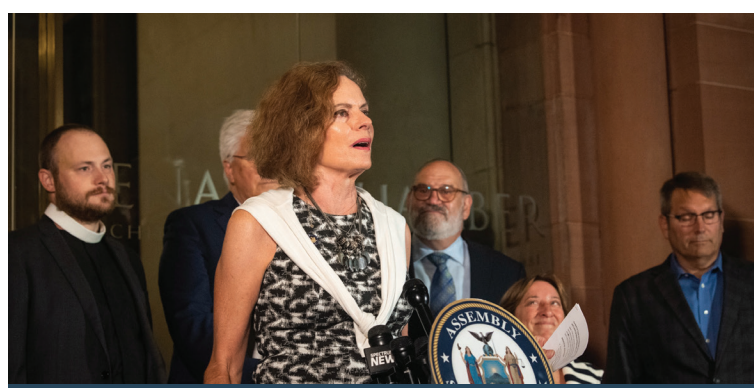
I joined a coalition of clergy and other debt advocacy organizations to announce the introduction of the New York Taxpayer and International Debt Crises Protection Act (A.10595).