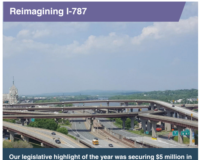
Our legislative highlight of the year was securing $5 million in the state budget for a feasibility engineering study to reimagine I-787 and reconnect downtown Albany to the Hudson River waterfront. Coupled with the $750 million Wadsworth Lab and Harriman Campus upgrade and consolidation, these projects have the potential to transform the Capital Region.