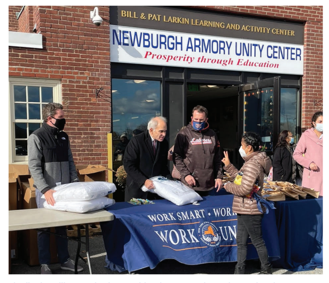
Distributing pillows and pajamas with Laborers Local 17 at the Newburgh Armory