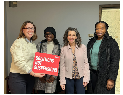
Left to right: speaking at Nonprofit Westchester's State Budget Forum Breakfast; with the students who participated in my inauguration; with advocates in Albany.

My office fields lots of emails and phone calls every day, including hundreds of comments on pending legislation. If you have sent a comment, please know that my staff and I do review every message and keep track of how many comments we receive in support or opposition to legislation under consideration, and plan to respond when there are updates on the progress of a law.