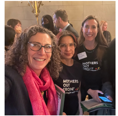
Left to right: asking questions at the public hearing on criminal justice data; with the members of the Legislative Women's Caucus at the welcome reception; with advocates in Albany.

I have also signed on to co-sponsor multiple pieces of legislation that align with my mission of building healthy communities - environmentally, economically, physically and mentally healthy, all through the lens of equity. You can stay up to date with the legislation I have signed on to at the Legislation tab of my Assembly web page, or click here . I was particularly proud to co-sponsor the second passage of the Equality Amendment, which will strengthen New York State's commitment to the right to privacy and equal protection under the law. Here is a video of my comments in support of the amendment, which will go before the voters in 2024.