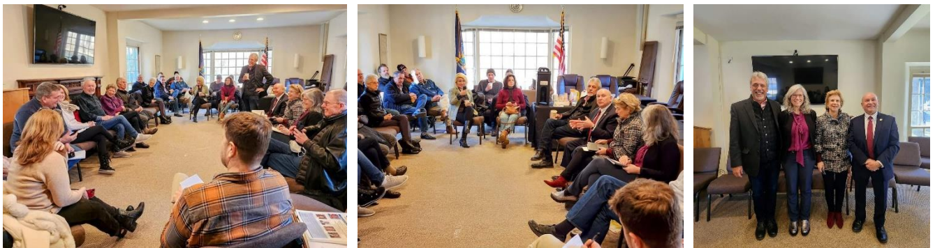
Photos from the recent events in North Salem (top) and Pound Ridge (bottom)

On a related note, I want to hear from you... what's on your mind? I have added a short survey to my website about what issues concern you most.