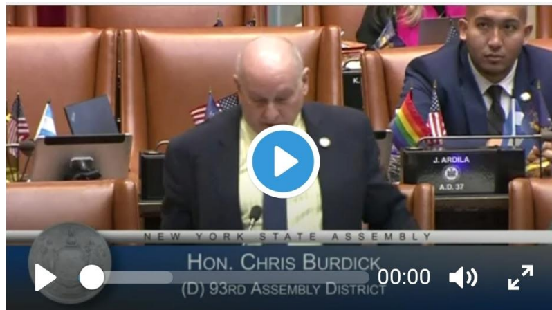
Speaking on the Assembly floor re: the Equality Amendment

Following the U.S. Supreme Court's devastating decision to overturn Roe v. Wade , enshrining reproductive rights in our state constitution is paramount. This measure builds on New York's record of protecting people's fundamental right to choose.