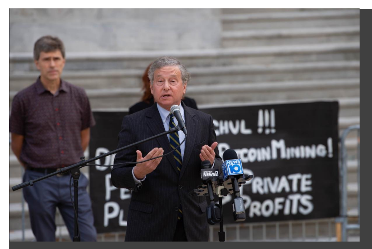
Cryptocurrency "mining" and Climate Change

This week I joined statewide environmental groups at an Albany press conference on the environmental issues linked to one form of cryptocurrency authentication called "proof-of-work" mining. The high energy use and emissions of this one method of authentication has raised concerns nationally and internationally regarding the ability to meet climate change greenhouse gas reduction goals.