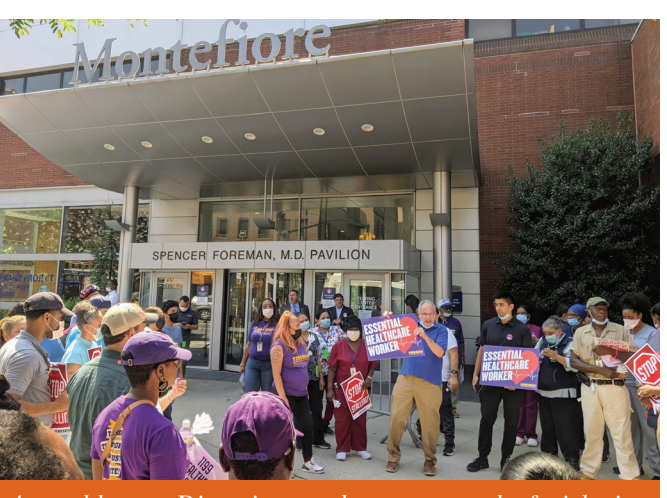
Assemblyman Dinowitz speaks to a crowd of picketing healthcare workers outside of Montefiore Hospital on East Gun Hill Road before joining them on the picket line.

Healthcare workers are vital to our community, but this may have never been more true than during the COVID-19 pandemic. I was proud to join picketing healthcare workers outside of Montefiore Hospital in their fight for a better contract.