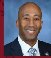
Assemblymember Clyde Vanel