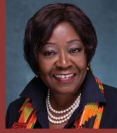
Assemblymember Crystal Peoples-Stokes