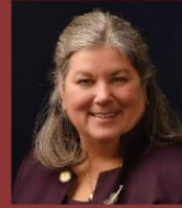
Assemblymember Carrie Woerner