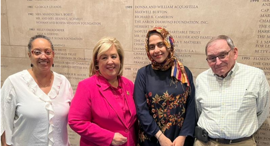
Community Board 8 Members joined the awards ceremony.