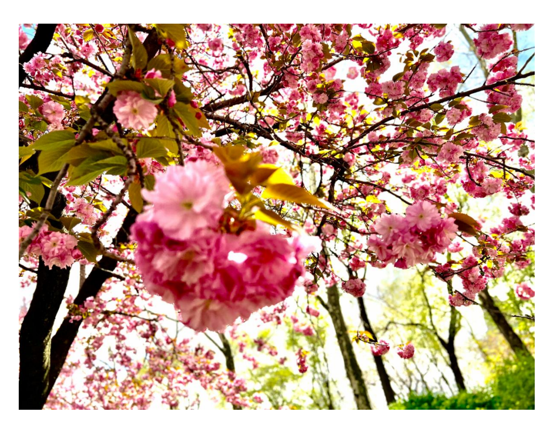
Cherry blossoms in bloom.