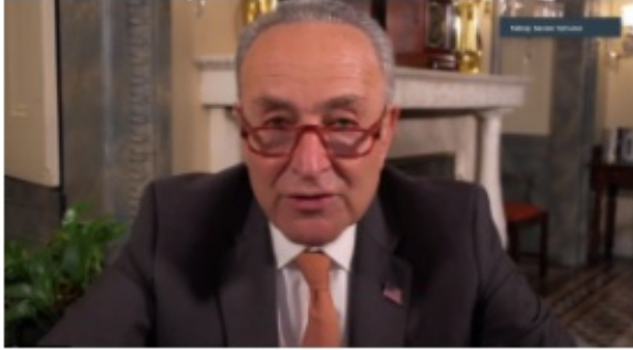
Charles E. Schumer, U.S. Senate Majority Leader