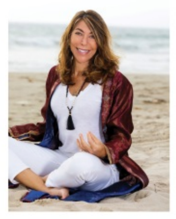
Beth Shaw Best Selling Author "Healing Trauma With Yoga"