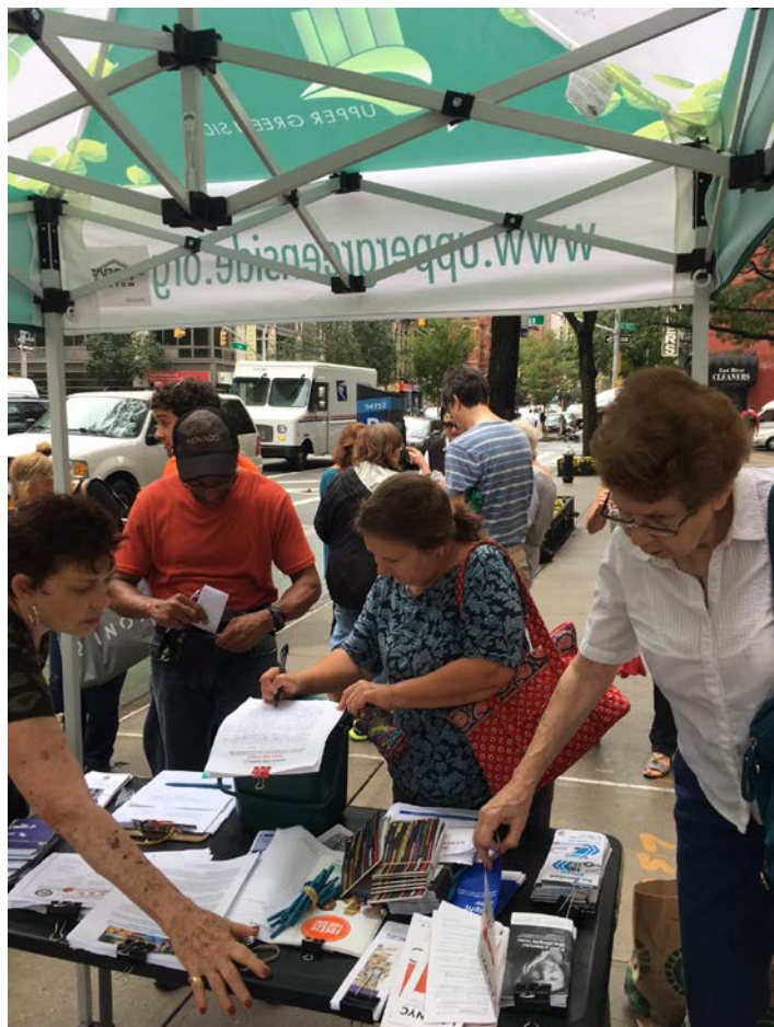
Constituents picking up resources from Seawright's table at the shred-a-thon.