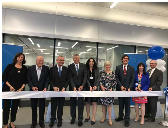
On Tuesday, October 10, the MSK Center for Laboratory Medicine held a ribbon cutting ceremony to mark the opening of a new facility on East 64th Street.