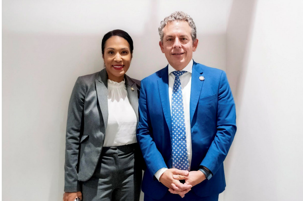
NYPD's 1st Deputy Commissioner Tania Kinsella.