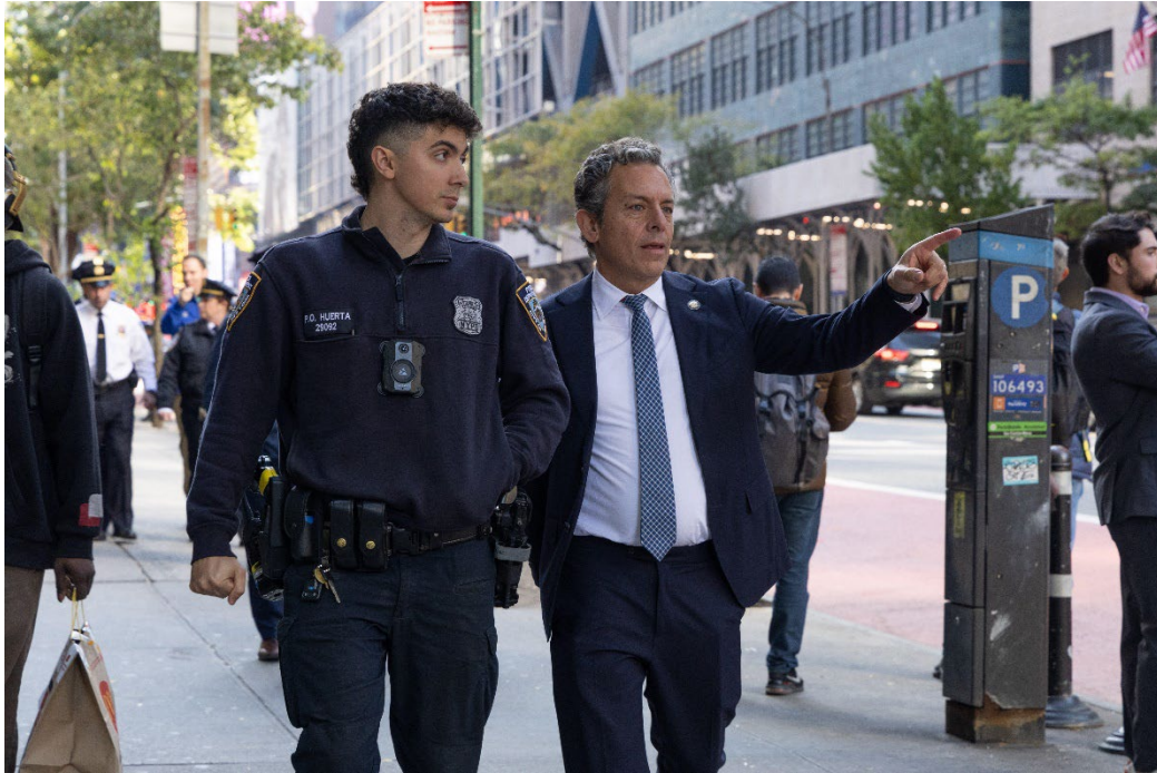
Walking West 42nd Street with NYPD.

This week, my office organized a walkthrough of West 42nd Street in front of the Port Authority Bus Terminal with elected officials, NYPD, the Department of Homeless Services, Department of Social Services and the Port Authority's police force to discuss the persistent public safety concerns that we have seen in the area. Community members have consistently shared their fears about increased crime in the area, particularly in front of a daycare on the block. My office took immediate action to remedy the situation, including working to bring down the scaffolding that had been in place in front of the daycare for far longer than was necessary. The agencies involved will be working closely together to continue to address the concerns in the area, and will be increasing outreach and police presence to keep the community safe.