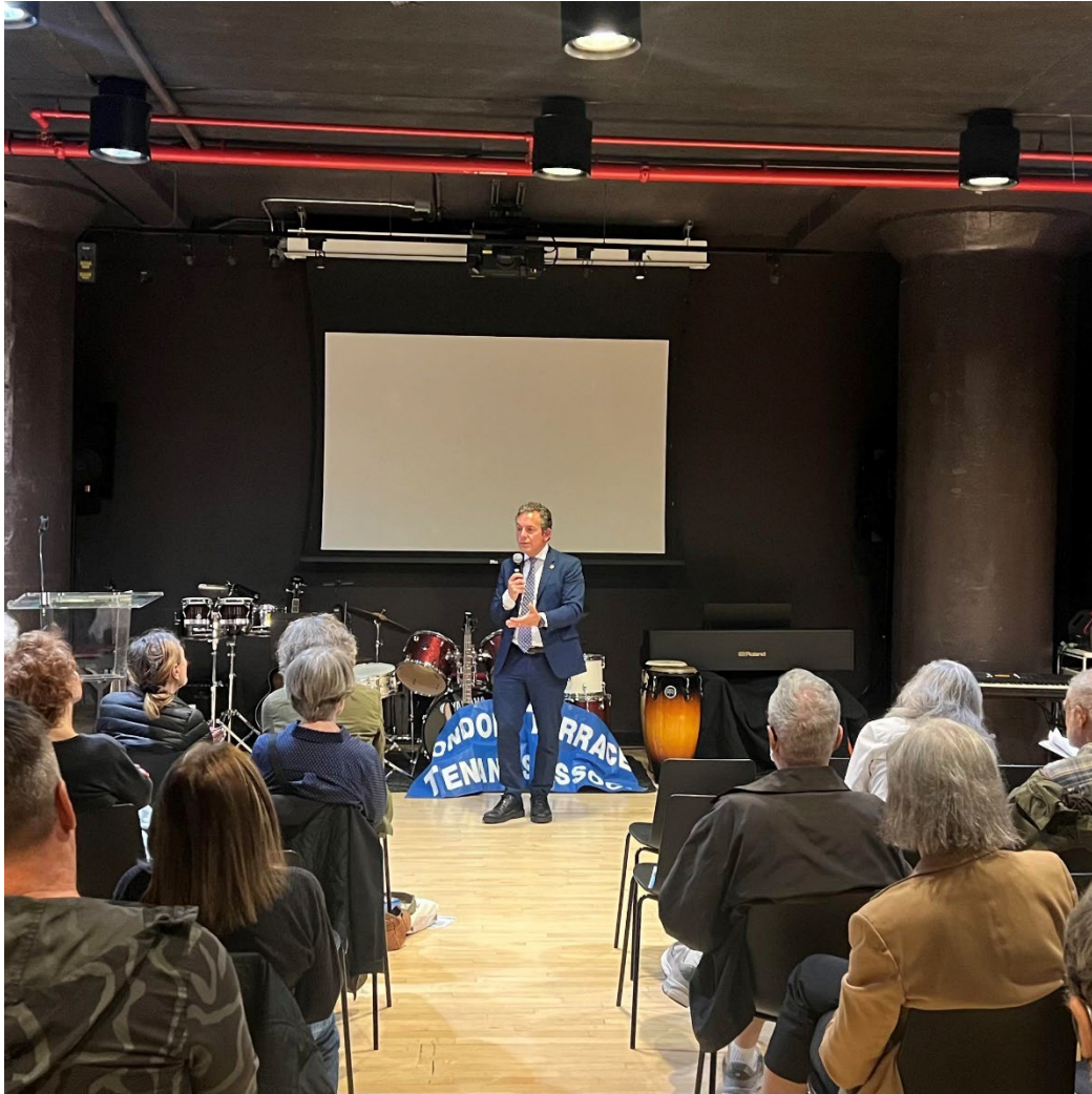
Speaking with the London Terrace Tenant's Association.

support for mental health funding; and urging Governor Hochul to sign the LLC Transparency Act.