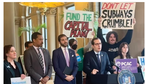
Fighting to make sure the MTA's plan for capital investments is fully funded.