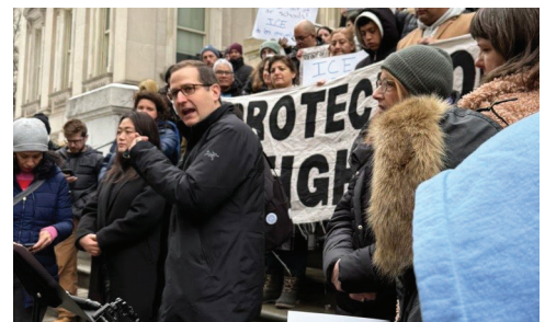
Rallying with immigration advocates to protest the Trump Administration and push for the New York for All Act (A.3506).