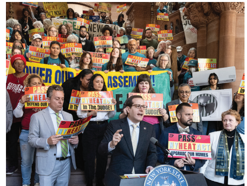
Proudly co-sponsoring the NY HEAT Act (A. 4870) to stop doubling down on fossil fuel infrastructure.