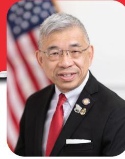
Assemblyman Lester Chang