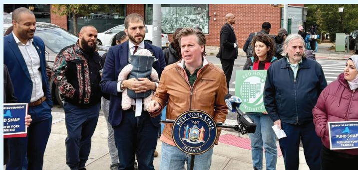
Assemblymember Carroll speaking at a rally with elected colleagues Senator Andrew Gounardes and Senator Jabari Brisport and advocates in support of fully funding SNAP benefits during the government shutdown.

The tax and spending bill (H.R.1) passed by Congress this July slashed funding for healthcare and food stamps putting millions of New Yorkers at risk and straining healthcare services. The legislature and Governor Hochul will need to find ways through the State's budget to mitigate the harm caused by federal cuts to safety net programs. This will require identifying additional broad-based revenue sources while strategically drawing on New York State's budget reserves to fill short-term budget gaps.