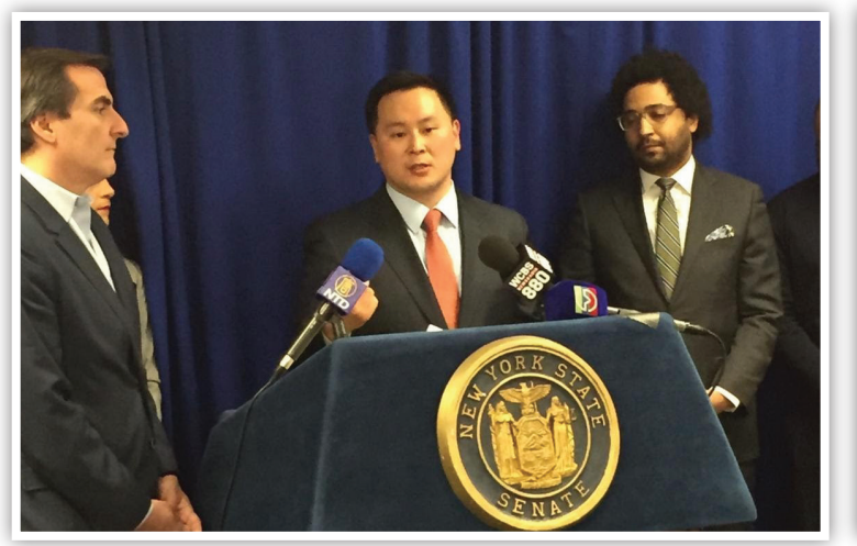
Assemblymember Kim announced legislation that creates an interstate compact designed to reel in corporate subsidy packages.