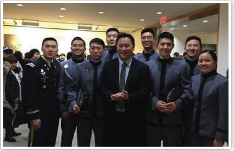
Assemblymember Kim met with young West Point cadets near the United Nations Headquarters.

New York State Assembly • Albany, New York 12248