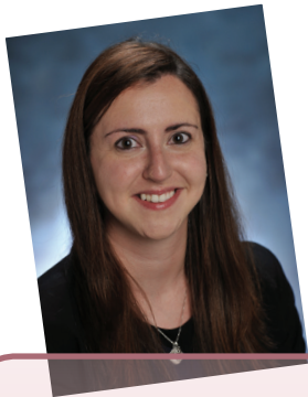
Assemblywoman Nily Rozic

New York State Assembly, Albany, NY 12248