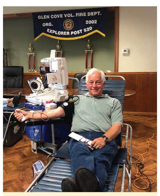
Charles D. Lavine Assemblymember, 13<sup>th</sup> District