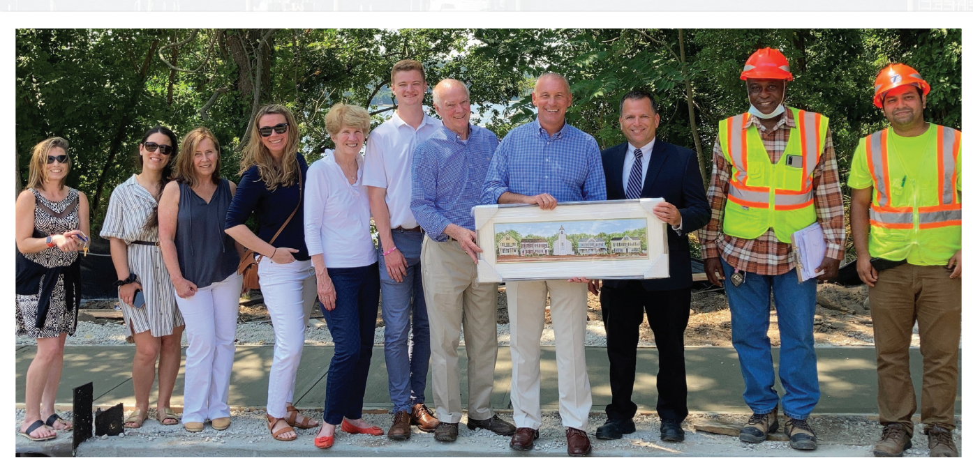
joined with the Cold Spring Harbor Main Street Association and NYS DOT to celebrate the groundbreaking of a major downtown beautification and traffic safety project that will enhance our quality of life.