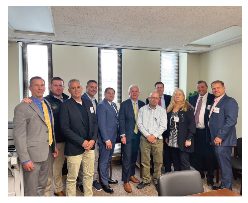
Long Island Builders Institute (LIBI) held its annual lobby day on April 25th. I met with a contingency that brought the voices of almost 700 member firms to Albany in support of smart, healthy and targeted growth of our communities, industry and real estate on Long Island.