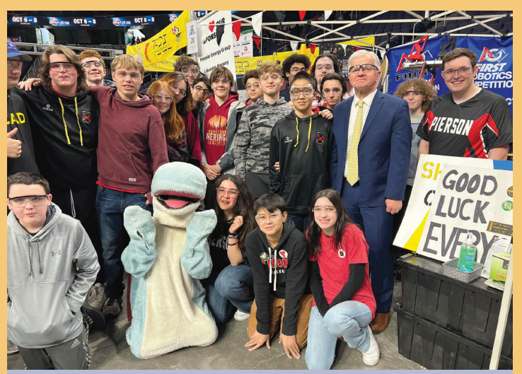
I took a break from budget negotiations to visit with the Pierson Whaler's Robotics Team 28 as they prepared for the 2023 NY Tech Valley Regional FIRST Robotics Competition at the MVP Arena in Albany on March 30th.