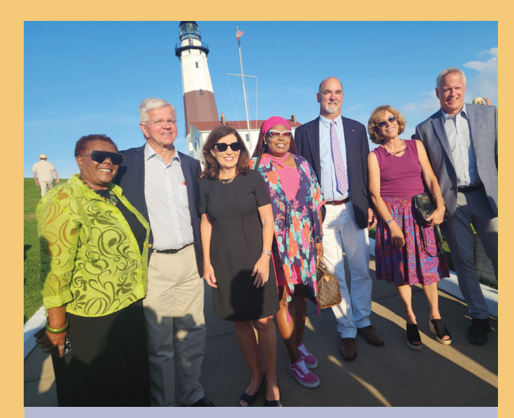
Celebrating the grand reopening of the Montauk Point Lighthouse with Governor Hochul, state and local officials, along with members and friends of Montauk Historical Society on August 16th.

Legislation I sponsored authorized the Department of Environmental Conservation to fund the erosion control projects needed to protect the Montauk Point Lighthouse, owned by the Montauk Historical Society (Chapter #310 of the Laws of 2016). This project paved the way for the State to partner with the U.S. Army Corps of Engineers to implement and complete the critical shoreline resiliency project that will keep the beautifully renovated lighthouse complex standing on a sound structure for generations to come.