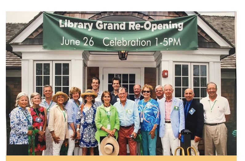
Celebrating the grand reopening of the Quogue Library on June 26th. Congratulations!