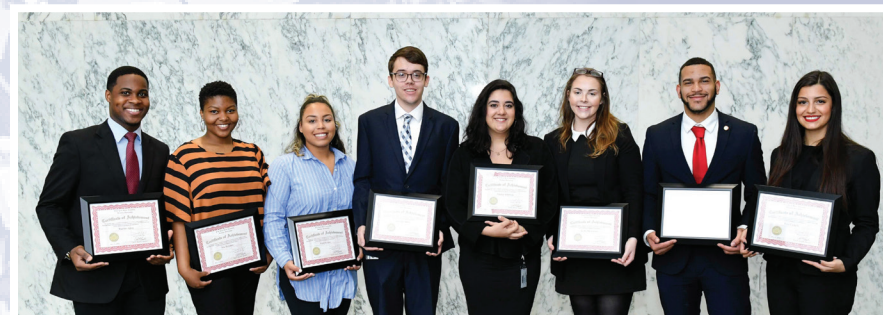
2019 Session Internship Research Paper Award Winners