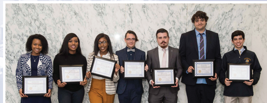
2019 Session Internship Mock Session Award Winners