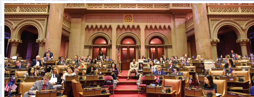
2018 Session Interns during Mock Session