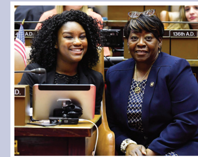
Assemblymember Crystal D. Peoples-Stokes (right)