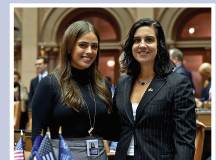
Assemblymember Nicole Malliotakis (right)