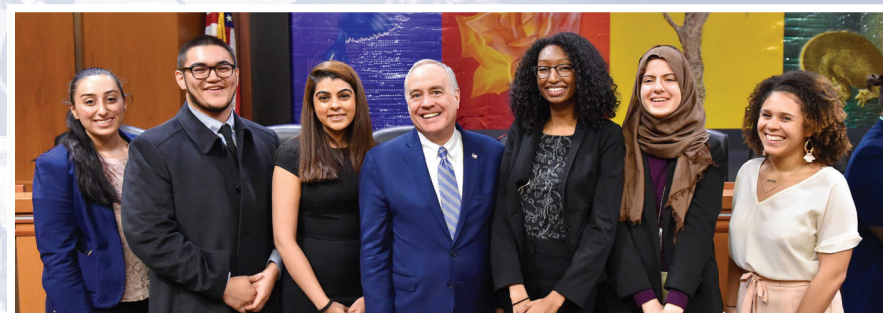
NYS Comptroller Thomas DiNapoli with 2018 Session Interns