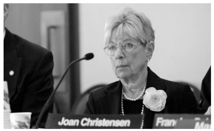
Assemblywoman Christensen listening to testimony at the Green Collar Jobs Hearing at the Capitol on June 9, 2009.

courses also better prepare students for the rigors of a post-secondary education.