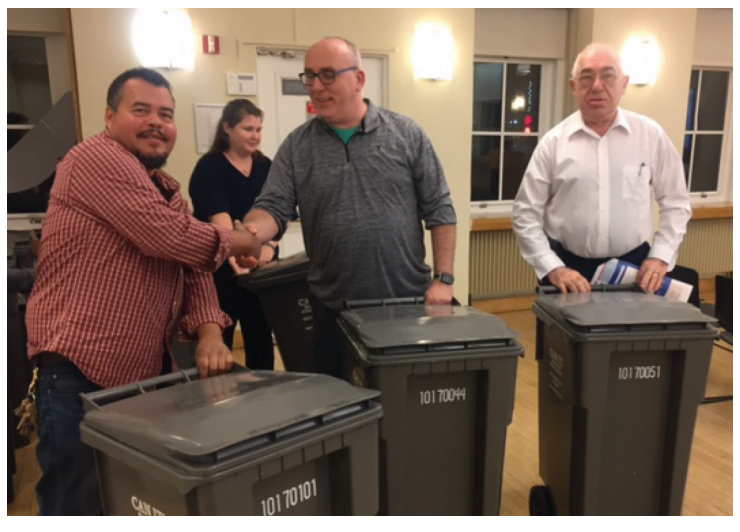
Seawright Hosts Free Rat Academy for the Upper East Side with the New York City Department of Health. Supers and tenants walked away with a free rodent resistant trash can for their property.