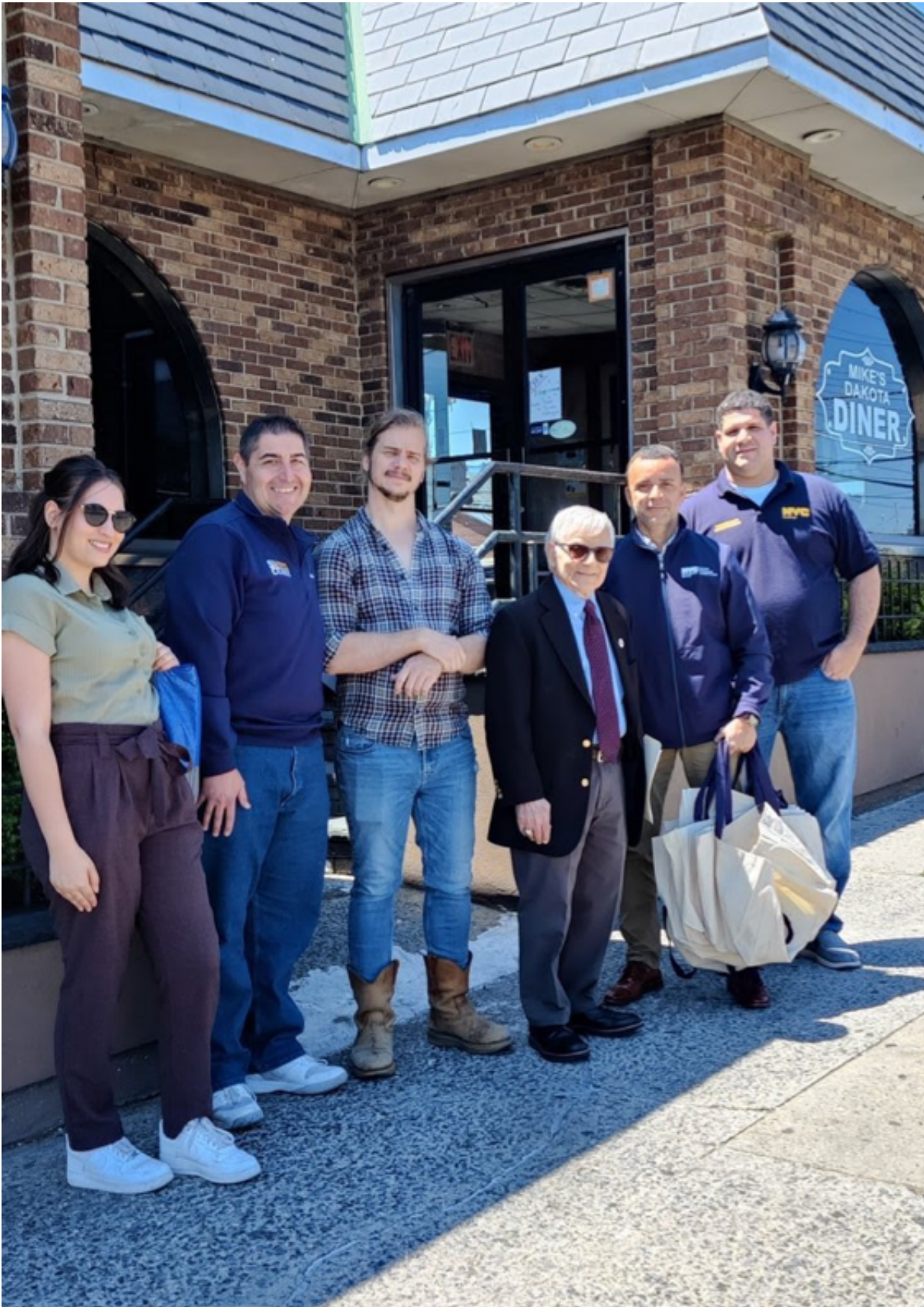
In celebrating #SmallBusinessMonth , my team partnered with NYC