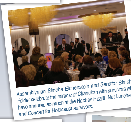
Assemblyman Simcha Eichenstein and Senator Simcha Felder celebrate the miracle of Chanukah with survivors who have endured so much at the Nachas Health Net Luncheon and Concert for Holocaust survivors.