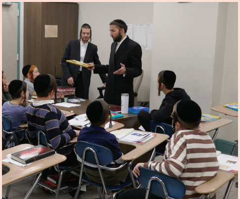
Assemblyman Simcha Eichenstein teaches a class of bright and inquisitive yeshiva students who were intrigued by our government and legislative process