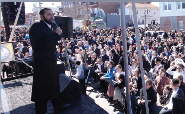
Assemblyman Eichenstein addressing the crowd at the Chol Hamoed Extravaganza in Boro Park