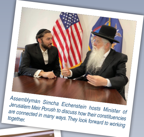
Assemblyman Simcha Eichenstein hosts Minister of Jerusalem Meir Porush to discuss how their constituencies are connected in many ways. They look forward to working together.