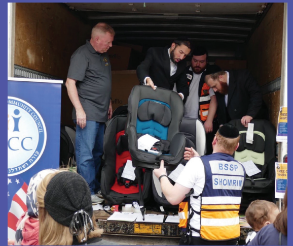
Assemblyman Simcha Eichenstein partners with BPJCC to distribute free car seats in Boro Park