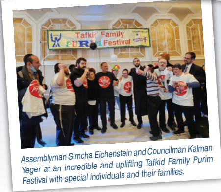
Assemblyman Simcha Eichenstein and Councilman Kalman Yeger at an incredible and uplifting Tafkid Family Purim Festival with special individuals and their families.