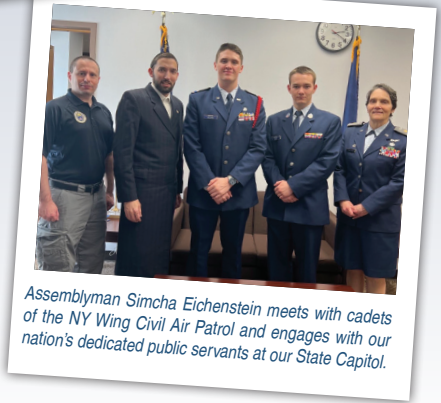
Assemblyman Simcha Eichenstein meets with cadets of the NY Wing Civil Air Patrol and engages with our nation's dedicated public servants at our State Capitol.

New York State Assembly, Albany, New York 12248