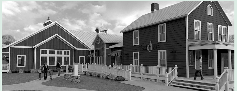
Rendering of the new Agriculture Development Center at CCE

The new facility will be home to classrooms, a commercial kitchen, and a new Taste NY market; all of which will be used to educate and train current and future food producers, helping them bring their products to market. The Center is next door to the year-round Farmers Market and will support a new generation of farmers and food entrepreneurs.