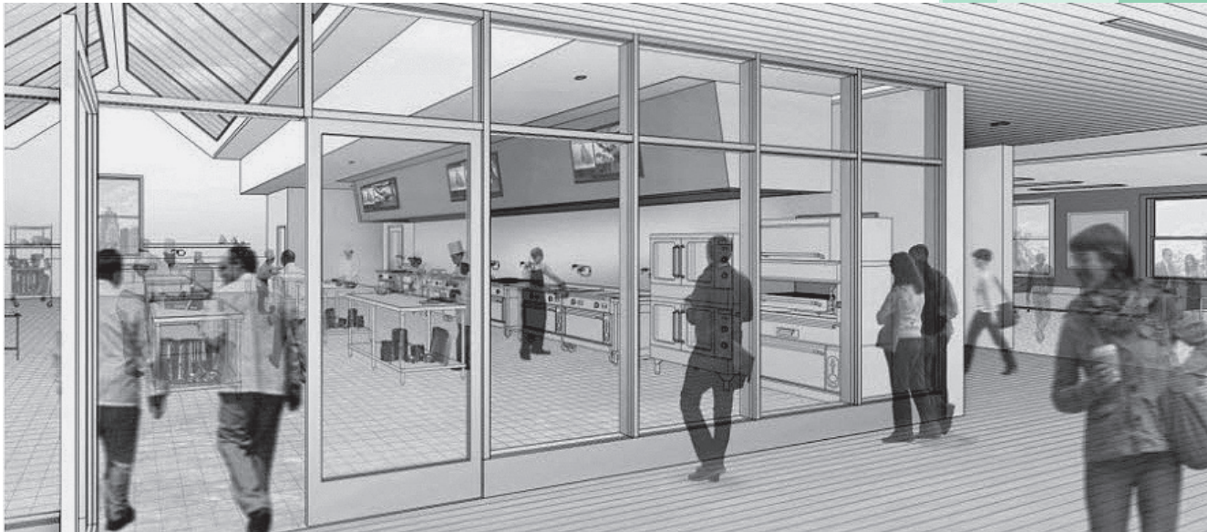
Rendering of new Culinary School at the historic Carnegie Library

SUNY Broome begins work soon transforming the old Carnegie Library in Downtown Binghamton into a state of the art Hospitality and Culinary School. I was able to secure $5 million through the State Budget, matching County and private funds to help with the building's restoration. This will allow the library to be transformed so that students can gain the knowledge and skills necessary to enter the growing local food and beverage industry. With the increase in area restaurants, brew pubs, wineries, and other venues, these students are in high demand.