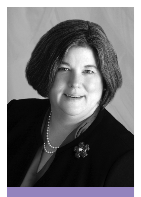
Assemblywoman Carrie Woerner