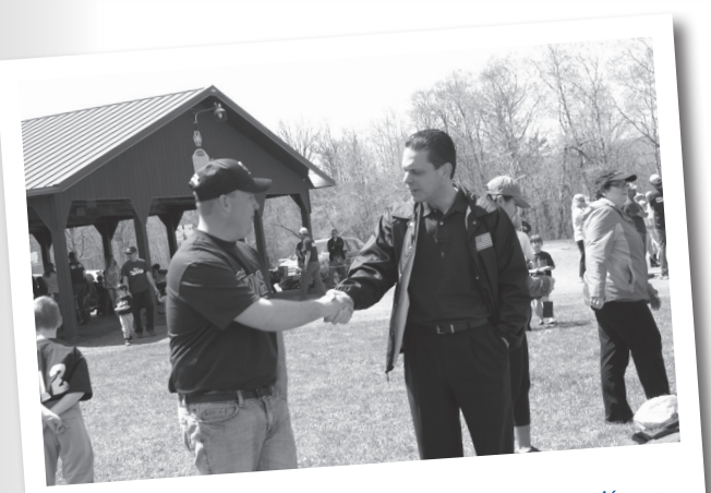
Greeting parents at Opening Day for the Berne-Knox Little League