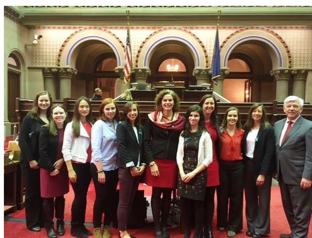
Lobbying Albany for Protections against Eating Disorders