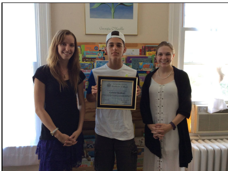
This summer, my office was fortunate to have