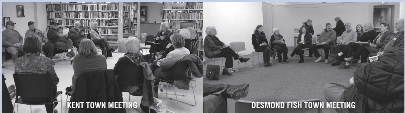
KENT TOWN MEETING