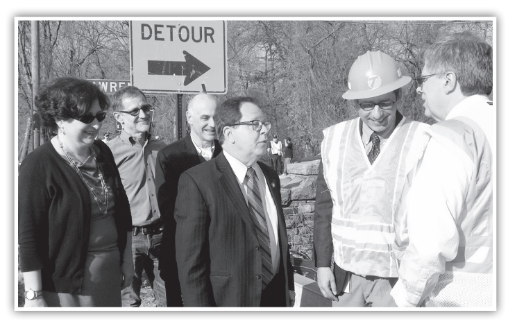
Ardsley Saw Mill Exit meeting with Department of Transportation.