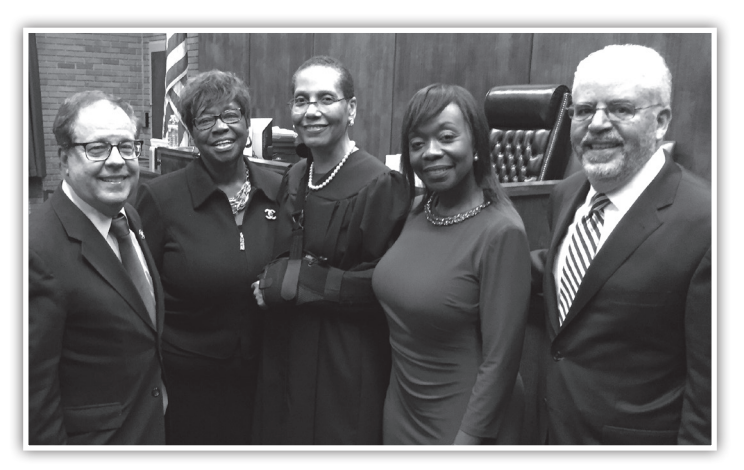
Greenburgh Town Judges' swearing-in ceremony.