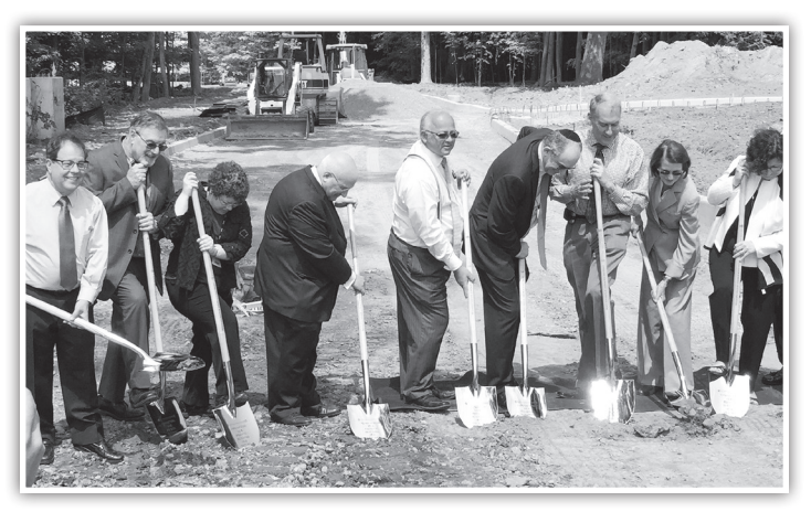
Westchester Medical College in Valhalla groundbreaking ceremony.