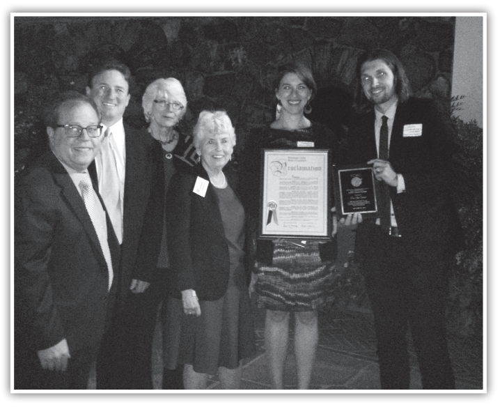
50th anniversary celebration of Federated Conservationists of Westchester County.

To decrease greenhouse gas emissions, the budget authorizes several programs to encourage the use of clean vehicles. The EPF will fund a clean vehicle initiative to give municipalities rebates up to $250,000 for clean-vehicle infrastructure and rebates of $750 - $5,000 for each electric vehicle purchased, based on the vehicle's range. The New York State Energy Research and Development Authority (NYSERDA) will administer a program to provide rebates up to $2,000 to consumers who purchase clean vehicles.