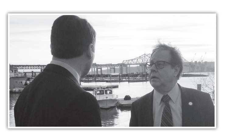
Discussing Tappan Zee Bridge barge accident with Westchester County Executive.