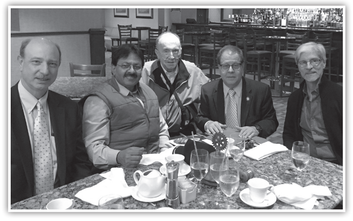
Elmsford Rotary Club.