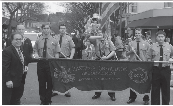
Sleepy Hollow St. Patrick's Day Parade.