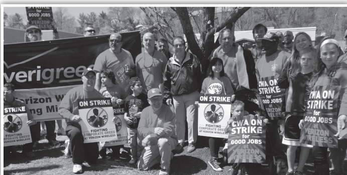
Hartsdale with striking workers.