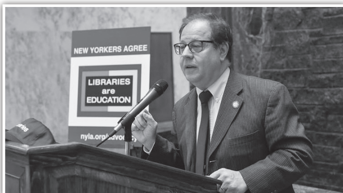
Assembly Libraries Committee Chair Abinanti spoke to New York Library Association members in Albany.

As Chair of the Assembly Committee on Libraries and Education Technology, Assemblyman Abinanti led successful efforts to increase (1) state library operating aid $4 million to $95.6 million, and (2) state library construction aid $5 million to $19 million, a 35% capital funding increase over last year and the first increase in nearly a decade.