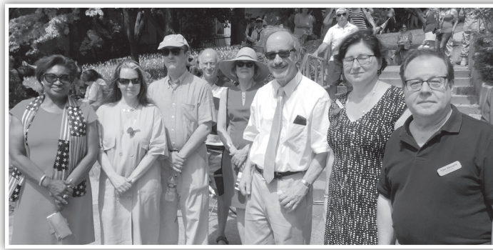
Hastings Memorial Day Parade.