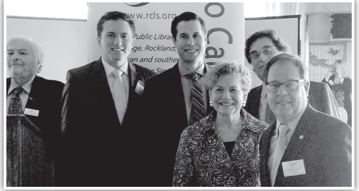
Assemblyman Abinanti spoke at the Ramapo Catskill Library System Legislative Breakfast.