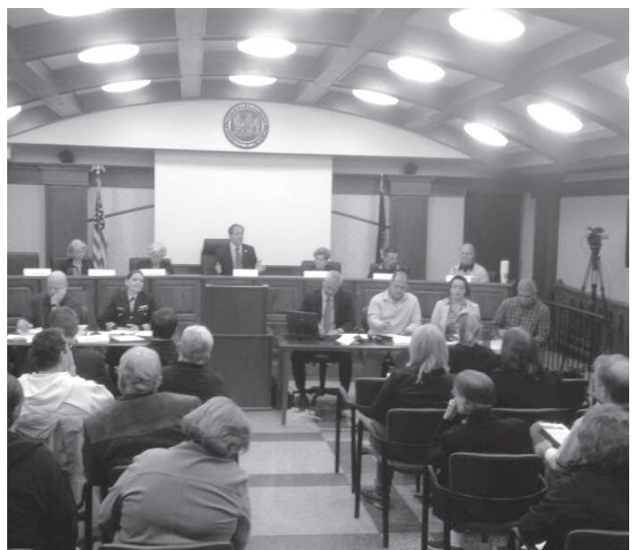
Assemblyman Abinanti addressing the boating safety forum at Tarrytown Village Hall.

Sign up at healthbenefitexchange.ny.gov or call 1-800-318-2596