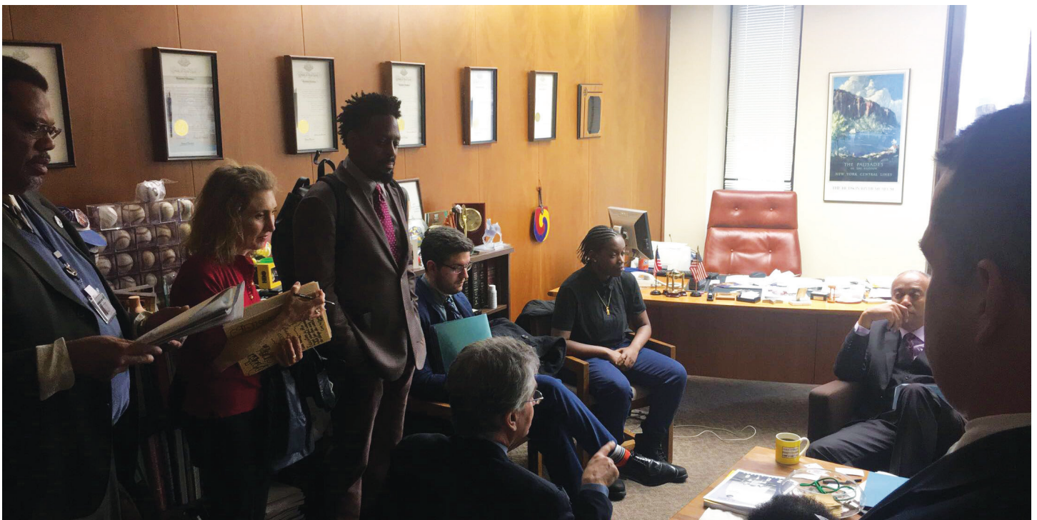
Board of Cooperative Educational Services (BOCES)

Here's how the challenge works: Mark a calendar for each day in August that your child reads with you, someone else or alone. Once you have marked off 25 days or more, please contact my office and I will award your child with a New York State Excellence in Reading Certificate. Thank you and happy reading!