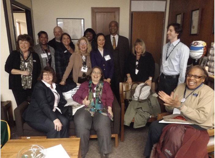
New York United Teachers