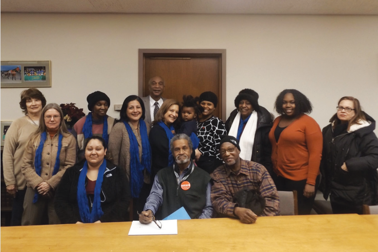
Neighborhood Preservation Coalition of NYS