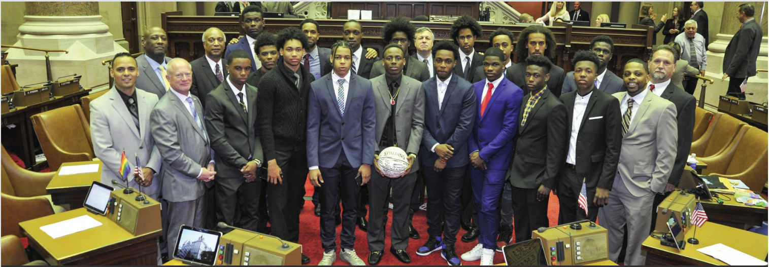
Mt. Vernon High School Boys Basketball Team "2017 NYS Champions" saluted at the State Capitol