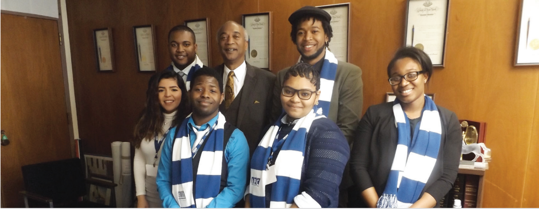
The College of Westchester advocating for TAP