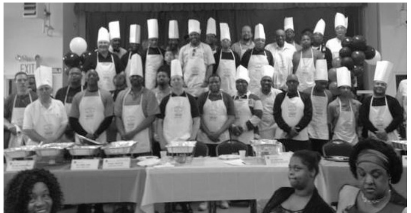
Imani Cultural Academy's Annual "Look Who's Cooking" Fundraiser.

In an increasingly technological world, it's vital to provide parents with the tools to keep their children's information safe. A new "Parents' Bill of Rights" has been created to give parents or guardians control of what student data schools can share. I also fought to protect our kids from identity theft by allowing parents or guardians to freeze the credit records of their children, even when no file yet exists, in order to stop child identity theft before it occurs. This measure has passed the Legislature and will soon be sent to the governor for final approval.