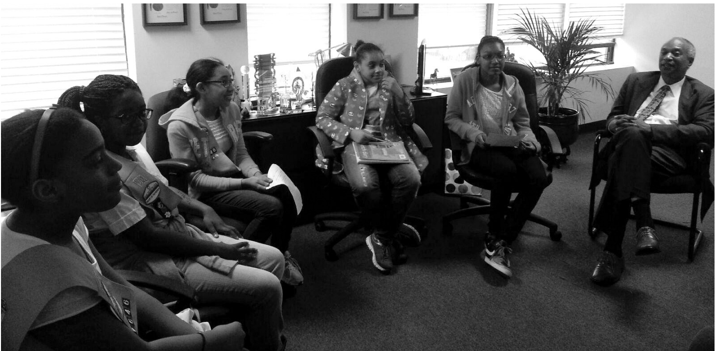
The City of Mount Vernon's Girl Scouts Troops #1632 and #1646 expressing their interests in civic affairs.

If you would like to obtain a health care proxy, please contact my office and we will mail one to you.