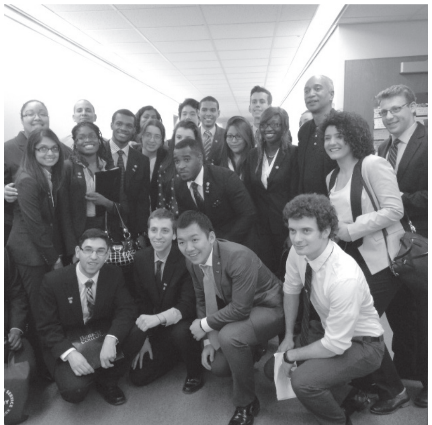
Meet and Greet with Baruch College—The City University of New York (CUNY) students.

Here's how the challenge works: Mark a calendar for each day in August that your child reads with you, someone else, or alone. Once you have marked off 25 days or more, please contact my office and I will award your child with a New York State Excellence in Reading Certificate. Thank you and happy reading!