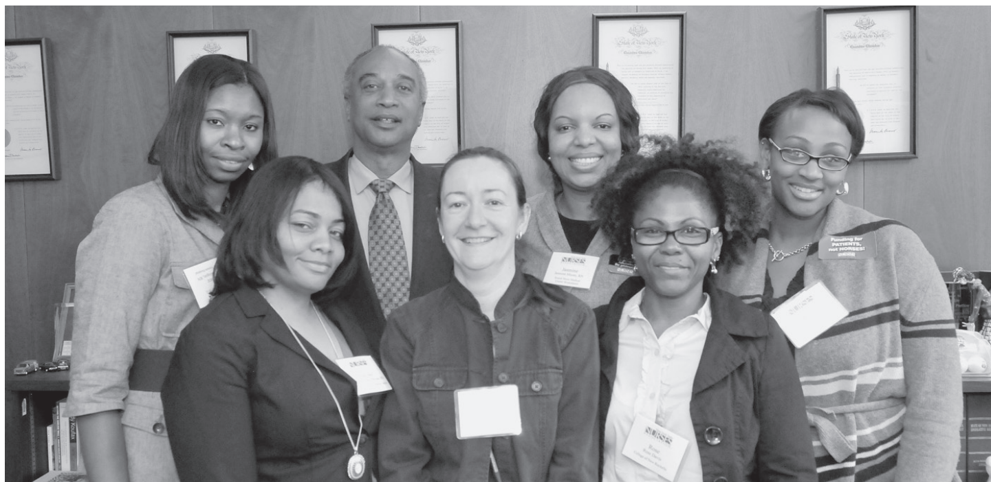
Assemblyman Pretlow meeting with college students and Registered Nurses to address their concerns.

If you are experiencing any of these symptoms it is imperative that you speak to your doctor immediately for a thorough exam and diagnosis. If you are diagnosed with prostate cancer and do not have insurance, you may be eligible for cancer treatment through the NYS Medicaid Cancer Treatment Program. For more information, please contact the NYS Dept. of Health at (518) 486-1383.