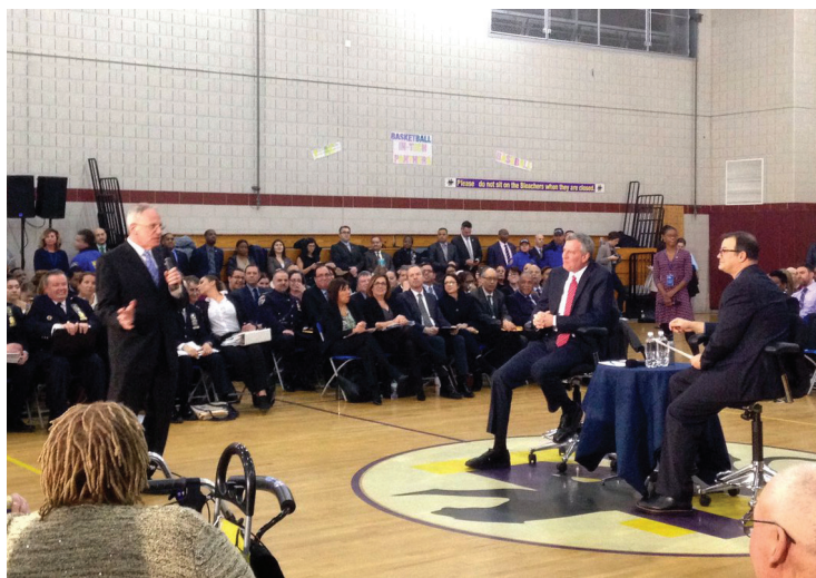
Assemblyman Dinowitz asked Mayor de Blasio to support construction of a new school in the Kingsbridge/Riverdale area at a recent mayoral town hall sponsored by Council Member Cohen.

At almost the same time, my office learned that the Amalgamated