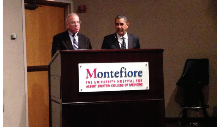
Assemblyman Dinowitz and newly elected Congressman (13 CD) Adriano Espaillat are pictured here speaking for the preservation of the Affordable Care Act at a recent town hall meeting they held at Montefiore Hospital.

New York will continue to take measures to protect its citizens from a hostile federal government intent on taking health away from its people.