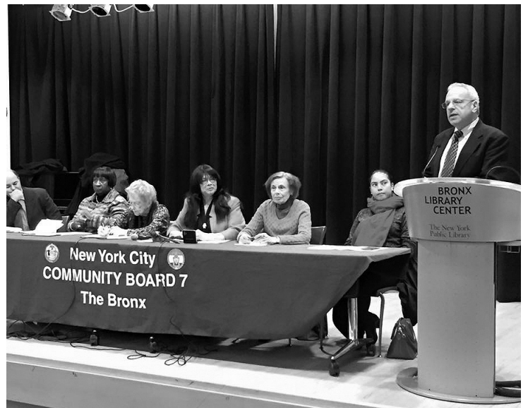
Assemblyman Dinowitz is pictured here speaking about community issues and legislative priorities for the 2016 legislative session at a meeting of Community Board 7.