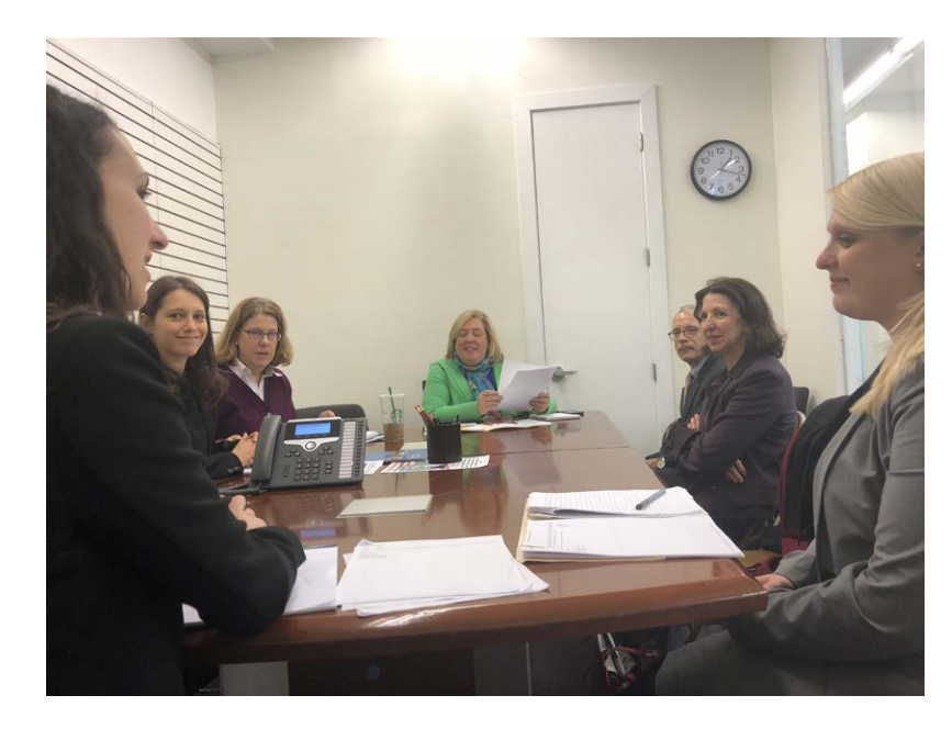
Seawright joins members of the Sanctuary for Families organization to discuss legislation combatting domestic violence.

Assembly Member Seawright Explores Ways to Improve Access to Breast Cancer Screenings