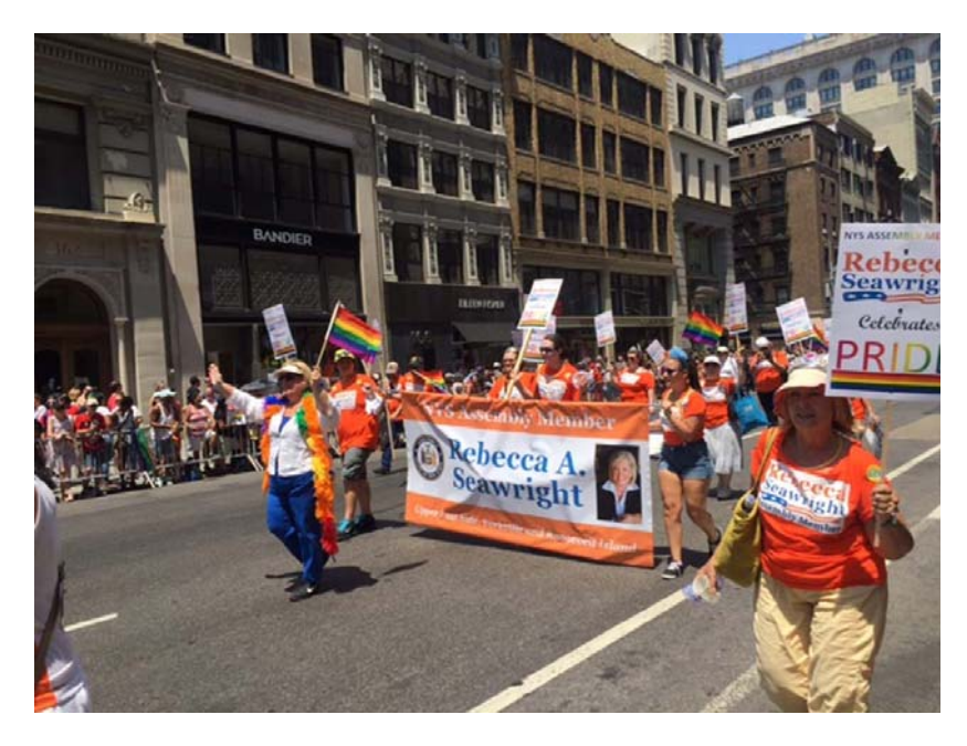
June 25, 2017