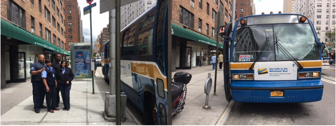
MetroCard Buses provide a full range of services, including applying for or refilling a Reduced-Fare MetroCard, buying or refilling a regular MetroCard, or getting answers to a MetroCard-related question. Vans sell Unlimited Ride MetroCards and Pay-Per-Ride MetroCards in addition to refilling MetroCards and Reduced-Fare MetroCards.